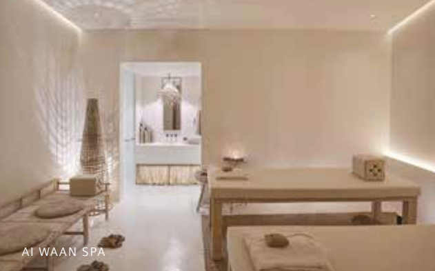
AI WAAN SPA