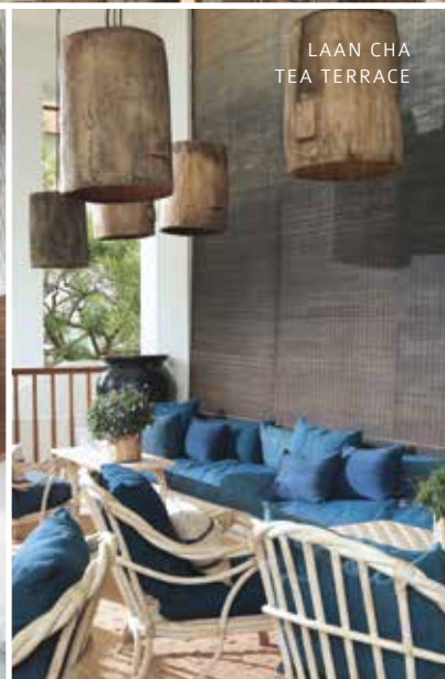
LAAN CHA TEA TERRACE