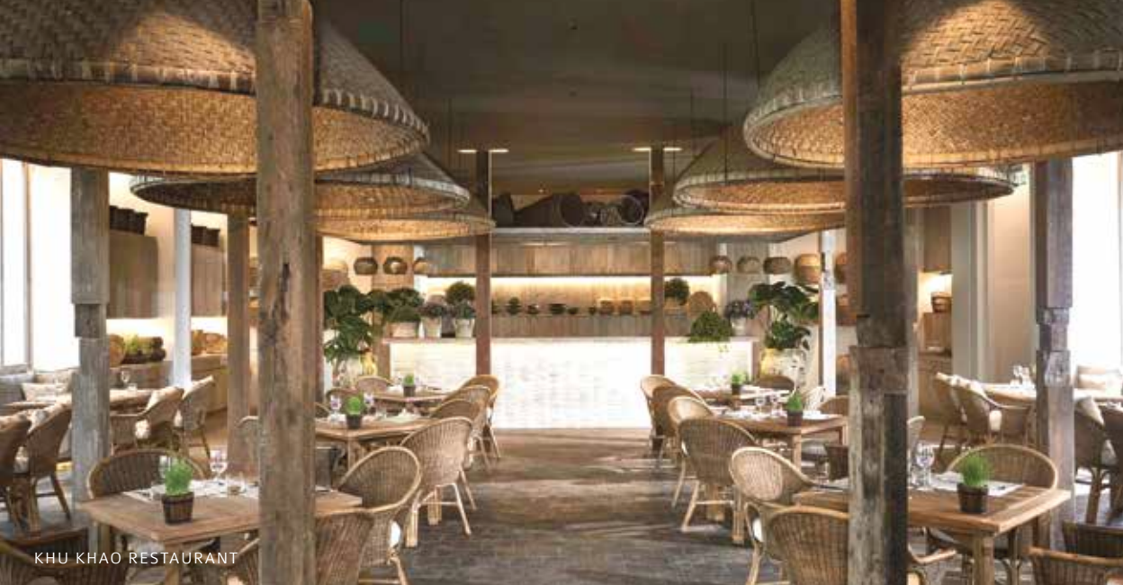
KHU KHAO RESTAURANT