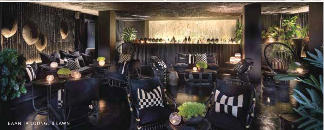
BAAN TA LOUNGE & LAWN